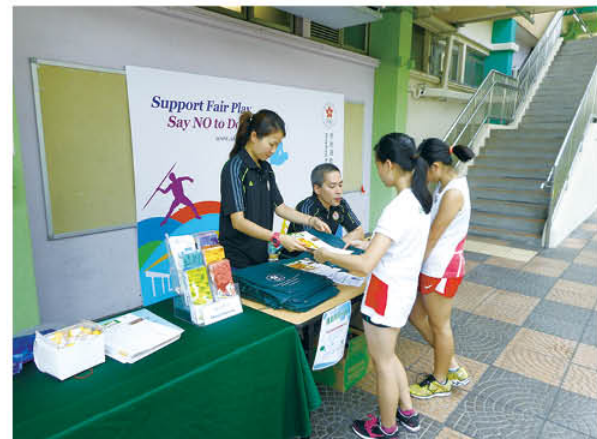
Outreach Programme at Hong Kong Athletic Championships 2015 at Wan Chai Sports Ground

period. In addition, 9 event outreach programmes were conducted at local competitions. In order to promote fair play to the general public and sport enthusiasts, outreach programmes were held respectively at the Hong Kong Marathon Carnival 2015 on 17 and 18 January 2015, the 58 th Festival of Sport Opening Ceremony on 7 and 8 March 2015 and the 2015 Olympic Day cum Olympic "Fun" Run on 21 June 2015, attracting more than 3,700 visitors.