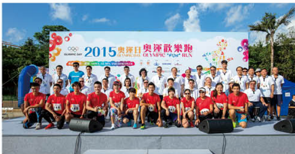
Group Photo of the Elected Officers of the Federation, distinguished guests with the SF&OC Team formed by serving and retired athletes