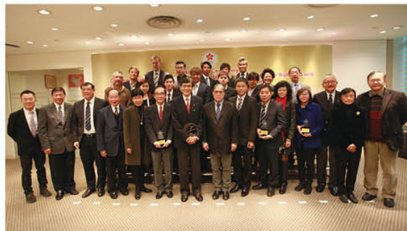
Presentation Ceremony of Commemorative Plaques to Sports Celebrities receiving Honour Roll 2015 and IOC Trophy 2015 – Sport and Innovation held on 30 December 2015 at Olympic House