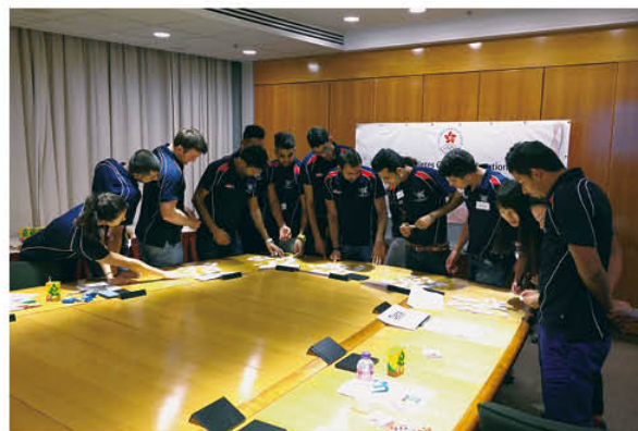
Athletes paid close attention during the career-related interactive activity for designing their career mapping.

In collaboration with various supporting corporates, HKACEP has been providing career support through job matching and internship opportunities to enable suitable candidates to pursue their second career after their retirement from sport. 80 retiring / retired athletes were offered full-time / part-time jobs with a total of 107 successful job matching cases since 2008.