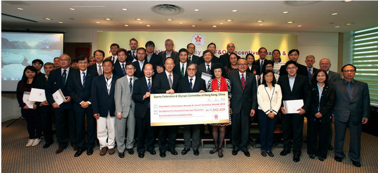
The Presentation Ceremony of SF&OC Incentive Awards & Junior Incentive Awards 2014