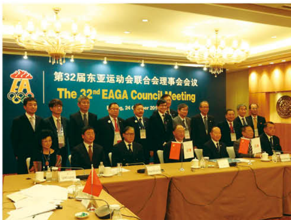
Group Photo at the 32 nd EAGA Council Meeting held in Beijing