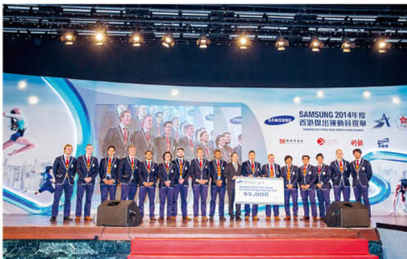
Hong Kong Rugby Union Men's Sevens Team receiving the 2014 Hong Kong Sports Stars Award for Team Only Sport from The Hon. MA Fung Kwok (right 8)