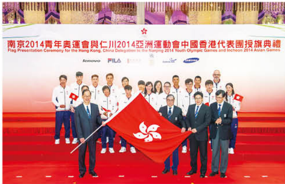
Flag Presentation Ceremony for the Hong Kong, China Delegation to the Nanjing 2014 Youth Olympic Games on 7 August 2014