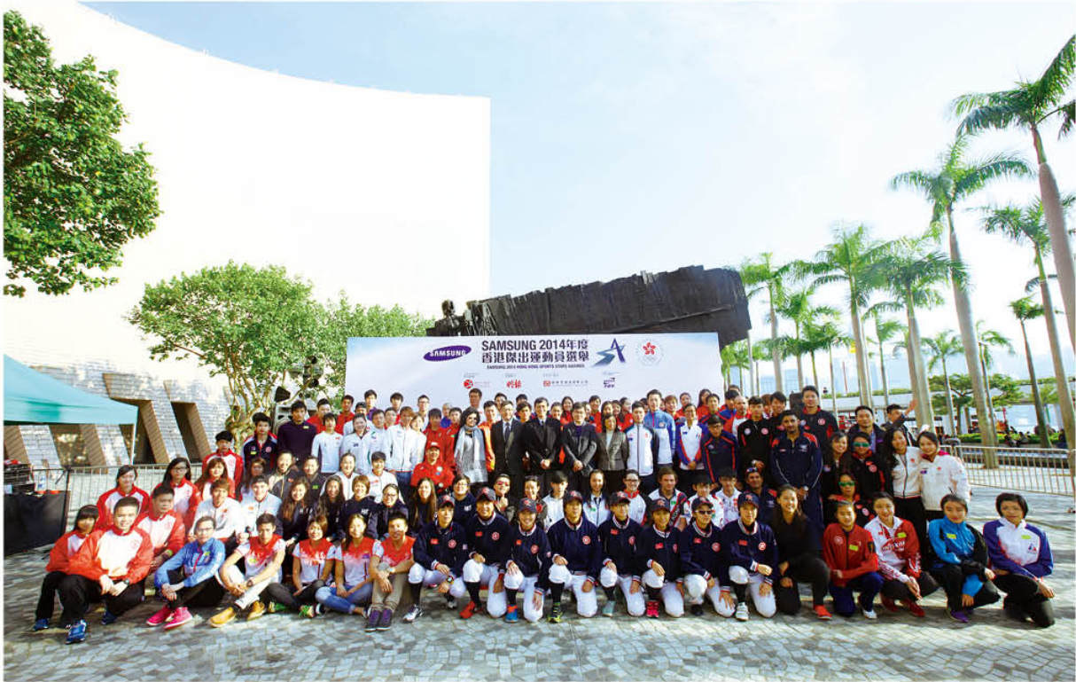
More than 100 athletes attended the Public Voting Announcement Press Conference at the Hong Kong Cultural Centre Piazza

The Announcement Press Conference was held at the Olympic House on 11 November 2014 to announce the details of the Rules and Regulations and the six awards categories to the press and NSAs representatives. The Public Voting Announcement Press Conference was held at Hong Kong Cultural Centre Piazza on 10 January 2015 at which the nomination lists were announced.