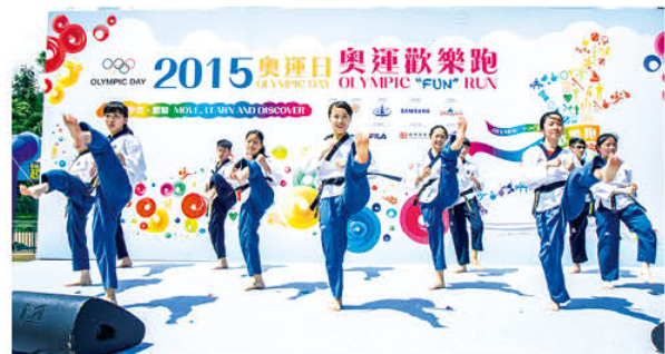
Taekwondo demonstration arranged by the Hong Kong Taekwondo Association

After the Run, the Federation invited some of our NSAs to give sports demonstrations including stretching exercise, Shuttlecock and Taekwondo to enhance the sports feature in the Olympic Day. Samsung, Panasonic and Hong Kong Disneyland Resort gave out prizes for the lucky draw sessions. In addition, a number of booths were set up and operated by Samsung, Panasonic, HKADC, and HKACEP respectively, in bringing more joy to the participants.