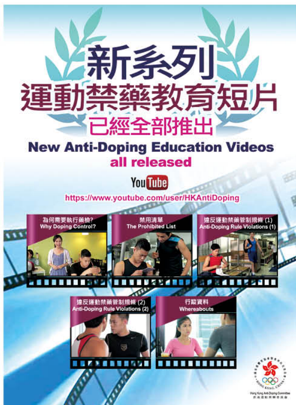
New Anti-Doping Education Videos are available on YouTube

HKADC launched a new series of videos to promote anti-doping knowledge by transforming the essence of the existing education materials into five lively videos. The videos covered various key topics on anti-doping including "Why Doping Control", "The Prohibited List", "Anti-Doping Rule Violations (Part 1 & 2)" and "Whereabouts". The videos were launched from January to May 2015 on HKADC YouTube channel.