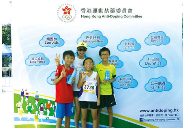
Participants in the HKADC's booth at 2015 Olympic Day cum Olympic "Fun" Run