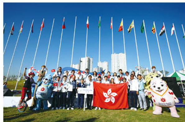
The Hong Kong, China Delegation at the Incheon 2014 Asian Games Team Welcome Ceremony on 18 September 2014