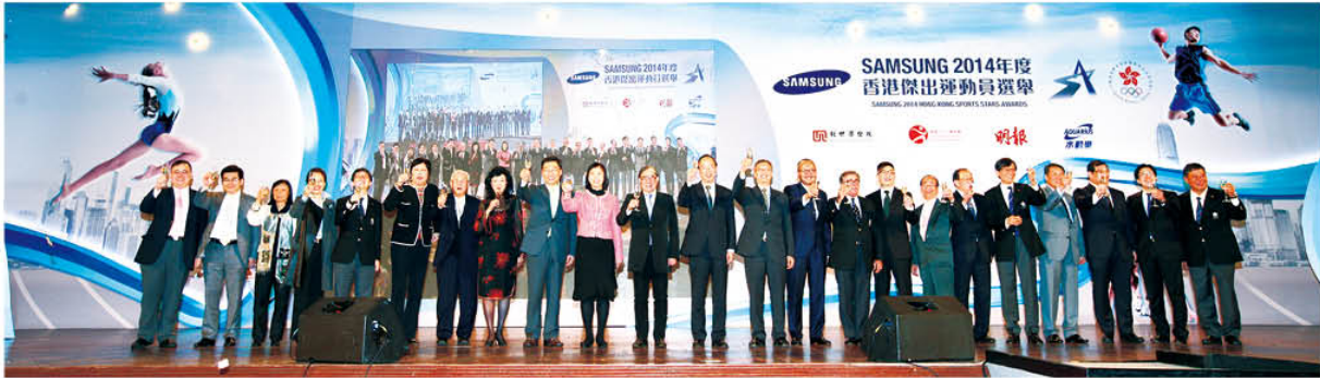
A toast of the Elected Officers of the Federation and the distinguished guests at the SF&OC Annual Dinner on 16 March 2015

Samsung Electronics H.K. Company, Limited was the Title Sponsor of the annual “Hong Kong Sports Oscar” for the second year and would continue its sponsorship until 2018. Other sponsors included Media Partner – Ming Pao Newspapers Limited, Principal Official Partner – New World Development Company Limited and Official Sponsor – Aquarius Electrolytes Replenishment Drink. A total of 120 nominations were submitted by 47 Member Associations for the Awards. There were 93 nominations for individual awards, 9 nominations for team only sport and 18 nominations for team events in the six awards categories. The six awards categories included Hong Kong Sports Stars Awards, Hong Kong Junior Sports Stars Awards, Hong Kong Sports Stars Award for Team Only Sport, Sports Stars Awards for Team Event, Hong Kong Potential Sports Stars Awards and Hong Kong Sportsmanship Sports Stars Award. A Vetting Committee was appointed to short-list the nominees and a Judging Panel for the selection of awardees. Other than the votes from the judges and local sports editors / reporters, the general public would also vote for four out of the six categories of the Awards.