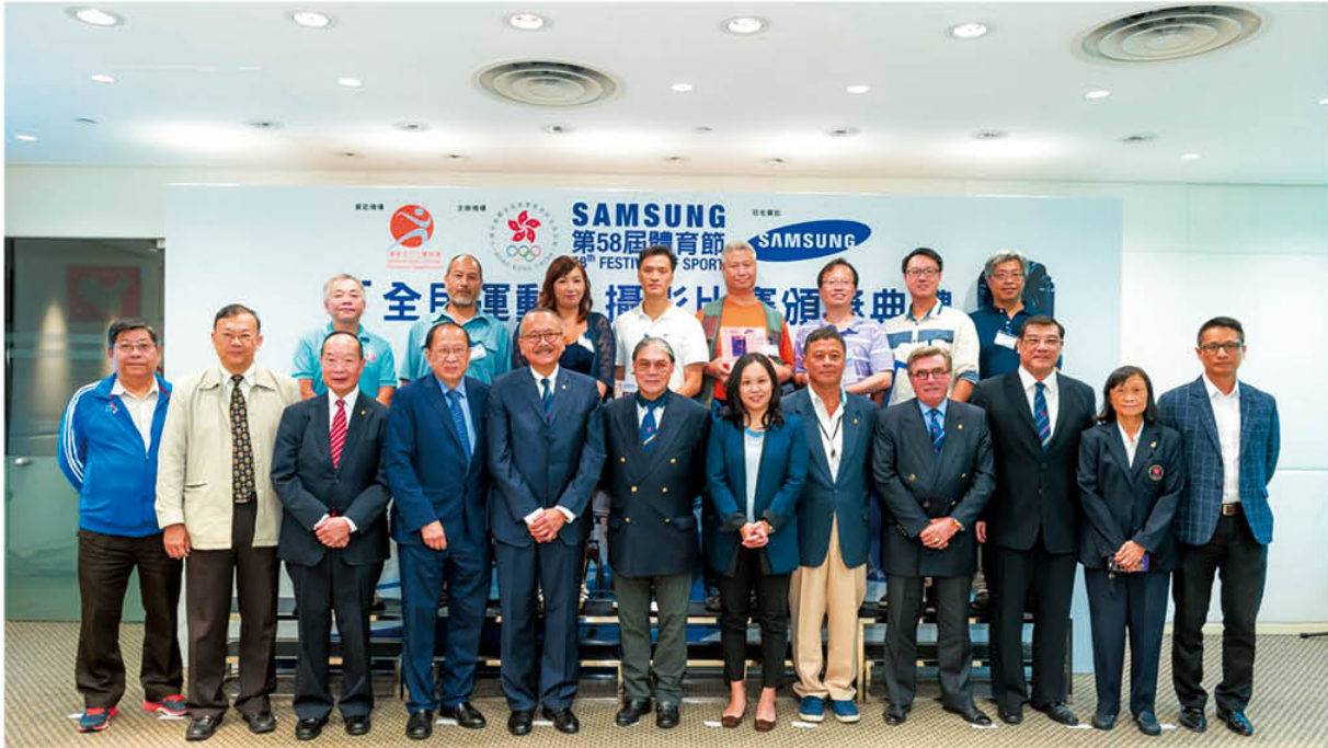
Group photo of the guests and the winners of the Photo Contest at the Awards Presentation Ceremony