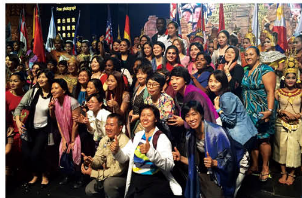
Group Photo of the participants in the IOC Leadership Seminar-Women and Sports for Asia