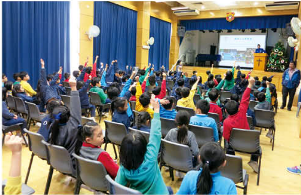
Students of Diocesan Preparatory School showed their understanding about Olympic Games and Paralympic Games through a quiz