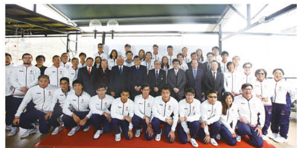
Welcome Home Reception for Hong Kong, China Delegation at the Closing Ceremony of Phuket 2014 Asian Beach Games on 18 December 2014