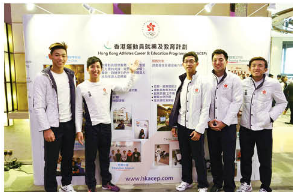
HKACEP promotional booth at the “Welcome Home Reception for the Hong Kong, China Delegation to the Incheon 2014 Asian Games”

In order to provide the latest information of HKACEP to more athletes, an introductory talk was held on 3 June 2015 for the Hong Kong Cricket team members.