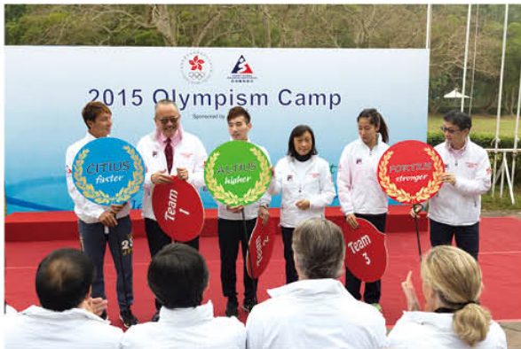
Naming of the three Teams of the 3 rd Olympism Camp - "Citius", "Altius" and "Fortius"

doping, athletes' career development path, media relation and athletes' obligation and responsibility. In addition, athletes were inculcated with the core values of Olympism including "Excellence, Respect and Friendship" through tailor-made team-building activities.