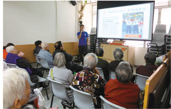
SEOP talk at Sage Chai Wan District Elderly Community Centre on 15 December 2014