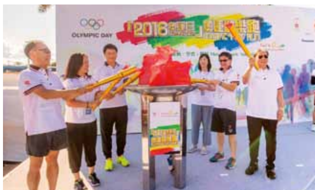
Officiating guests lighted up the cauldron at Opening Ceremony to kick-off the 2016 Olympic Day – Olympic Fun Run