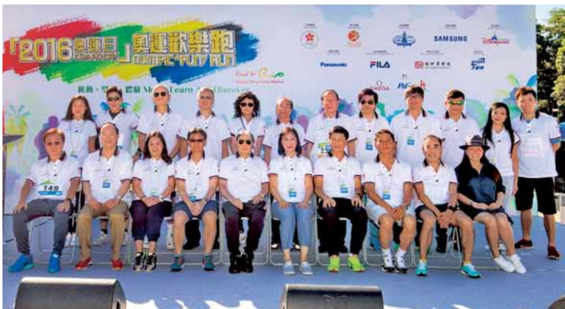
Photo of guests at the Opening Ceremony

Olympic Day in Hong Kong is an annual spectacular event organized by the Federation to celebrate the establishment of the IOC and to promote Olympism to the public. Under the patronage of the IOC, the Federation has been organizing Olympic Day Run annually since 1987. Olympic Day is nowadays developing into much more than a run or just a sports event. The three pillars of Olympic Day are “move, learn and discover”. This year, an Olympic Day Outreach Programme (ODOP) was newly launched to further promote the three pillars through sports, cultural and educational activities.