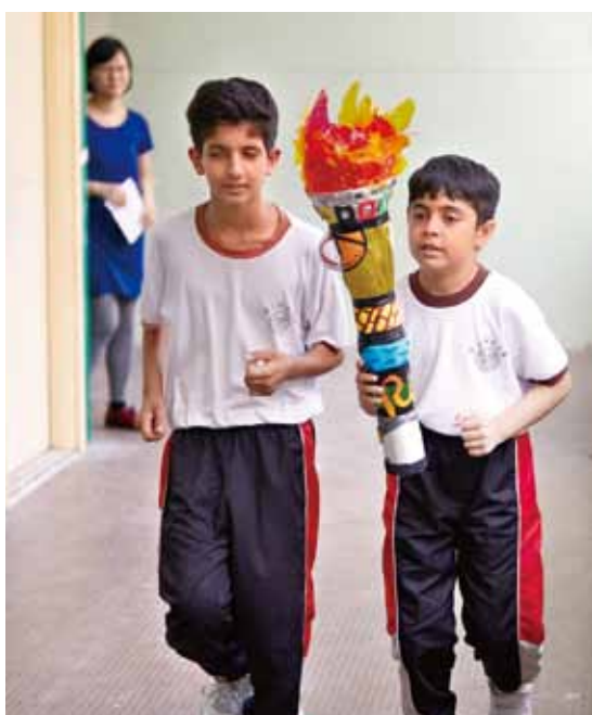
Students participated in the activity of torch relay, spreading the Olympic spirit and relaying the message of friendship and peace