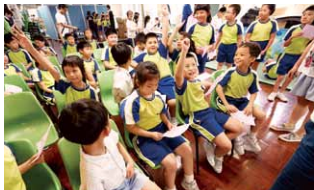
Students experienced the Olympism and Olympic value through the activity of video appreciation