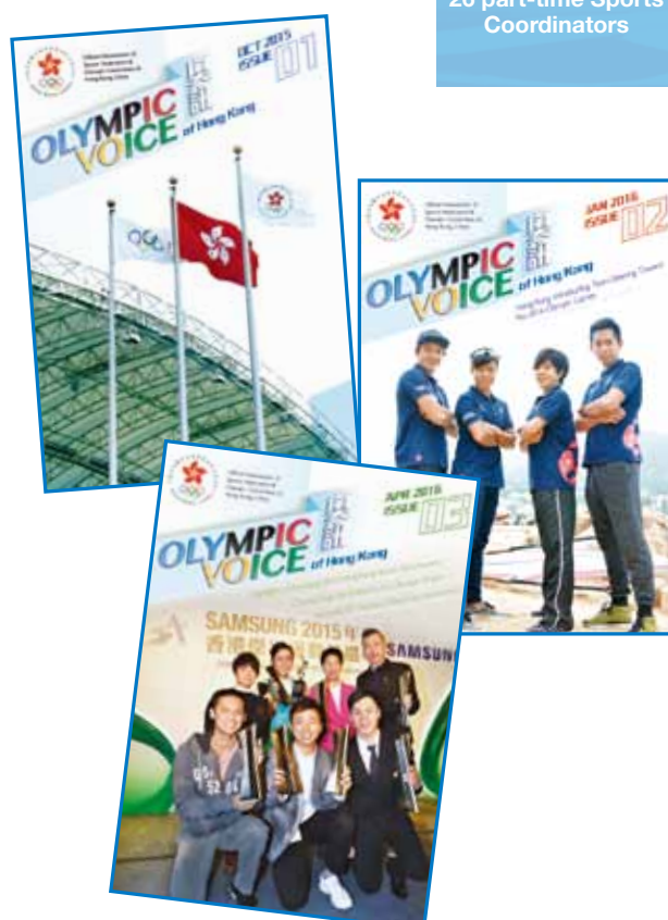
The first three editions of Olympic Voice of Hong Kong have been published in October 2015, January 2016 and April 2016 respectively

To foster close communication with Member Associations, sports community and the general public, the Federation has regularly updated the official website at www.hkolympic.org , the website of MCOHL Office at www.olympichouse.org , the website of HKACEP Office at www.hkacep.com and the website of HKADC Office at www.antidoping.hk to provide updated information. The Olympic Voice of Hong Kong reports the updates of the sports community and promotes local and overseas sports competitions and events. Apart from printed version, the Federation publishes an Olympic Voice advertorial version in one local Chinese newspaper to further promote the Olympic Movement in Hong Kong to the public.