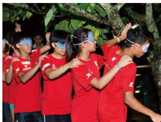
Night Walk at the 2015 Summer Youth Leadership Camp on Olympism