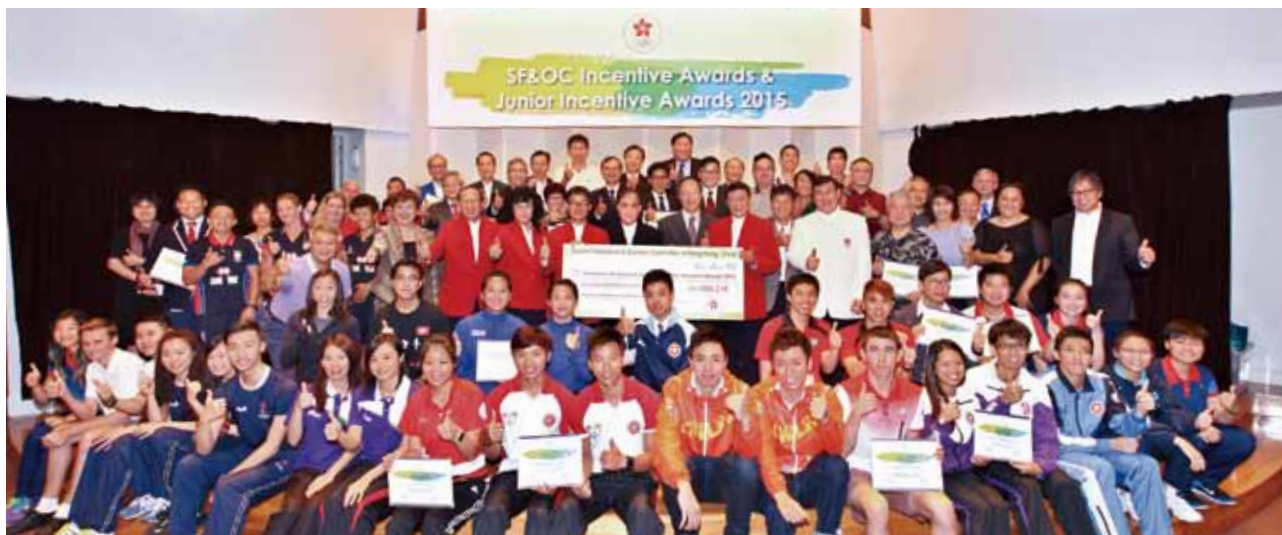
Group photo at the Presentation Ceremony of SF&OC Incentive Awards & Junior Incentive Awards 2015 held on 17 June 2016

Hong Kong Wushu Union was the recipient of maximum Award amount of $100,000 under the Incentive Awards Scheme and Hong Kong Amateur Swimming Association was the recipient of maximum award amount of $60,000 under the Junior Incentive Awards Scheme.