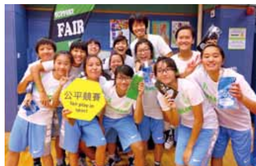
HKADC shared anti-doping information and promoted the message of fair play at the "All Hong Kong Schools Jing Ying Basketball Tournament" on 17 December 2015

HKADC continued to publish its newsletter "TrueSelf" on a quarterly basis to update the local sport community on the latest anti-doping development and knowledge.