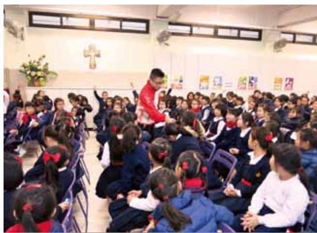
Students of St. Clare's Primary School showed their understanding about Olympic Games through a quiz