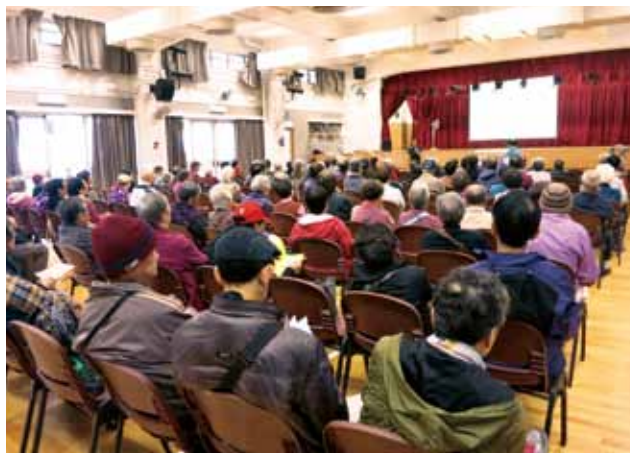
SEOP talk at Shatin Multi-Service Centre for the Elderly on 22 December 2015

A total of 128 talks including 72 talks at schools and 56 talks at community centres were held during the reporting period. The 20 serving and retired athletes were invited as speakers of respective talks and to share their sporting experience with a total of 17,756 participants.