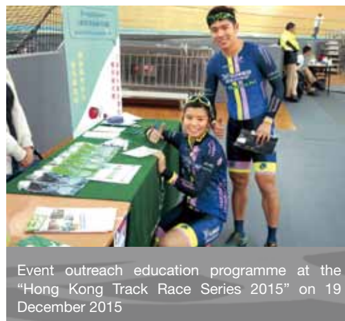
Event outreach education programme at the "Hong Kong Track Race Series 2015" on 19 December 2015

HKADC organized 9 event outreach programmes for various local sport events. Outreach counters at the Hong Kong Sports Institute continued on a regular basis with a total of 3 sessions conducted during the reporting period. In order to promote fair play to the general public and sport enthusiasts, an outreach programme was also held at the Hong Kong Marathon Carnival on 9 and 10 January 2016, having attracted more than 1,700 visitors.