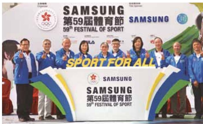
The Kick-off Ceremony of Samsung 59 th Festival of Sport

A four-day Opening Programme of the Samsung 59 th FOS was organized from 27 February to 1 March 2016 to encourage active participation of the public to have a foretaste of different kind of sports. The Programme included sports demonstration and trials presented from 27 to 28 February 2016 as well as the exhibition of the “Festival of Sport” and “Road to Rio” held from 27 February to 1 March 2016.