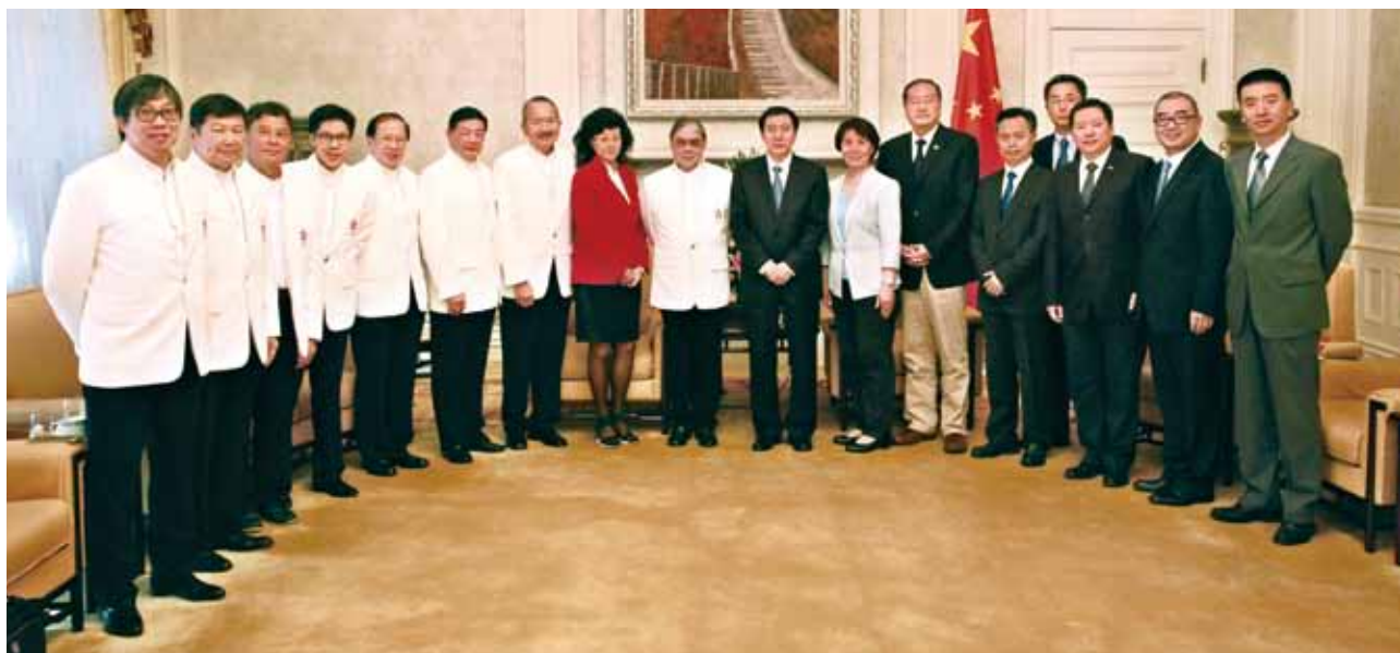
Photo with Beijing 2022 Winter Olympic Games Organizing Committee during the visit of Chinese Olympic Committee