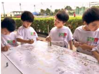
Children were signing on the banner to show their support to our athletes