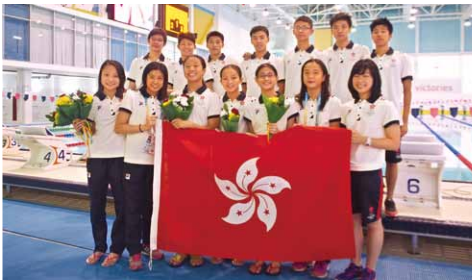
Hong Kong Swimming Team grabbed 4 gold, 3 silver and 9 bronze with a total of 16 medals in the 6 th Children of Asia International Sports Games

The Delegation comprised 40 young athletes aged 13-16 and 15 officials participating in athletics, swimming, table tennis. The Hong Kong, China Delegation returned home with 5 gold, 7 silver and 16 bronze medals, total of 28 medals. The Flag Presentation Ceremony was held on 24 June 2016 at the HKSI and the Welcome Home Ceremony was held on 2 September 2016 at the Tamar Park.