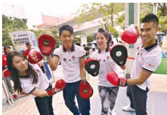
The four FOS Ambassadors participated in the sports trials