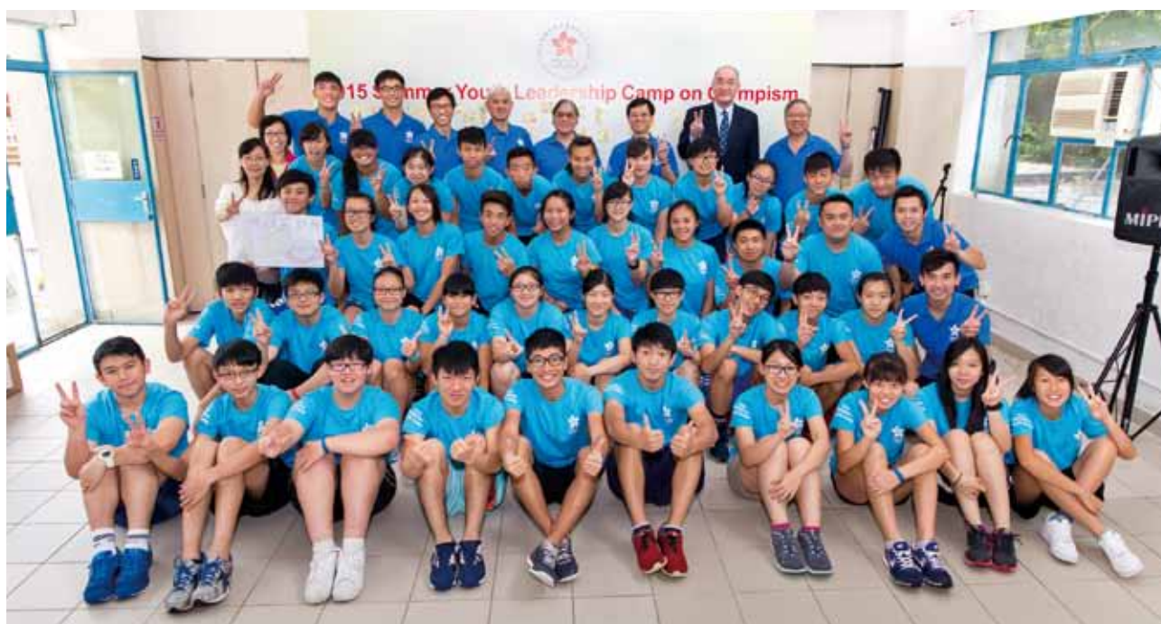
Group photo at the Closing Ceremony of 2015 Summer Youth Leadership Camp on Olympism