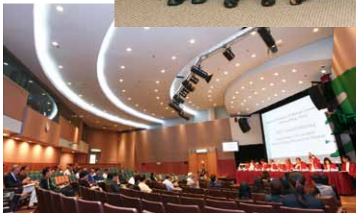
At the 370 th Council Meeting