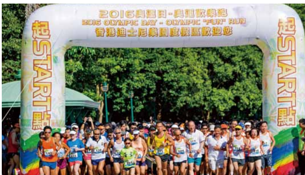
All runners started off on a sunny day

After the Fun Run, the Federation invited Hong Kong Tug of War Association and Physical Fitness Association of Hong Kong, China to have sports demonstrations with an Olympic carnival atmosphere. A number of booths were set-up and operated by Samsung, Panasonic and Physical Fitness Association of Hong Kong, China Ltd. respectively. A set of display panels was placed at the venue to promote Olympic-related knowledge and raise public awareness of the Rio 2016 Olympic Games. In addition, Samsung, Shun Hing Group and Hong Kong Disneyland Resort gave out prizes with a total value of around HK$220,000 for the lucky draw sessions.