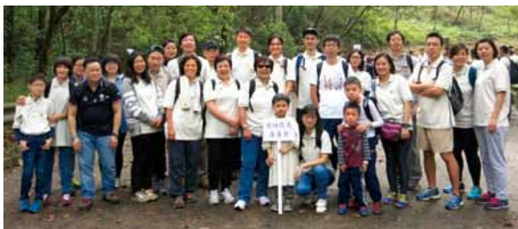
Group photo of the SF&OC representatives at the 2016 Hong Kong Tree Planting Day in Tai Tong, Yuen Long on 19 March 2016

"Earth Hour 2016" by the WWF Hong Kong; "Recycle your own Cartridge" by the Greeners Action; "Plastic Recycling Partnership Scheme" by Yan Oi Tong EcoPark Plastic Resources Recycling Centre; and "2016 Hong Kong Tree Planting Day" by the Hong Kong Tree Planting Day Organizing Committee.