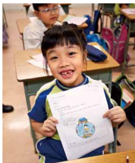
Students designed unique medals in Olympic theme and schools' characteristics