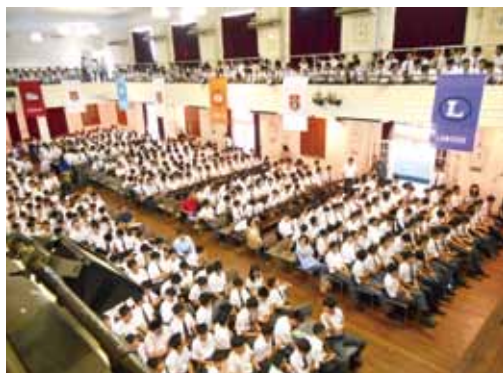
Education talk organized by HKADC for the Diocesan Boys' School on 1 June 2016