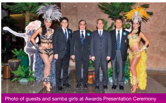
Photo of guests and samba girls at Awards Presentation Ceremony