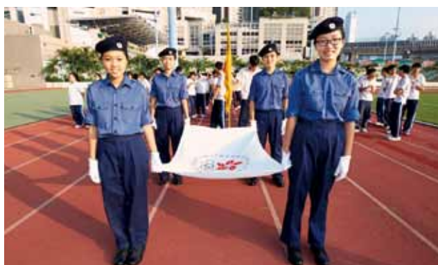
By staging modified versions of Olympic opening ceremonies in schools' sports day, students experienced the solemnity of the Olympic ceremonies