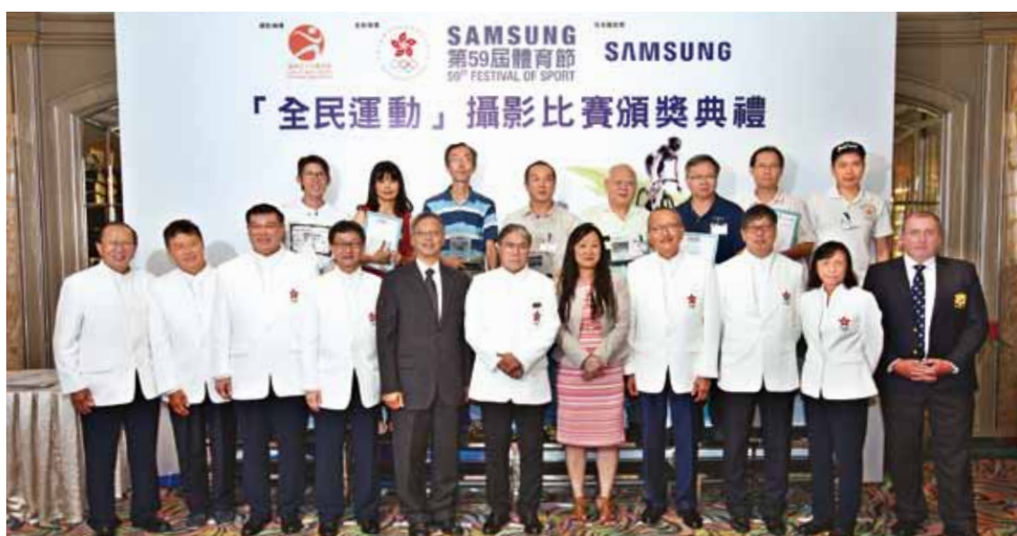
Photo of Samsung 59 th FOS Organizing Committee and the winners of the Photo Contest at the Awards Presentation Ceremony on 5 September 2016

The "Sport for All" Photo Contest has been organized since the 55 th FOS to increase public awareness of the FOS events and encourage more participation from the spectators in capturing the exciting moments of the events. Same as previously, the Photo Contest was divided into 2 categories: "Professional Awards" and "My Favourite Photos Awards". Public response was the most enthusiastic in this fifth edition that 499 eligible photo entries were received by the deadline. To attract more voters for the Photo Contest, the Federation conducted the public voting through social media "Facebook" for the first time this year. This adoption drew around 9,000 votes and public awareness by capturing and "Like" every exciting moment of the Festival.