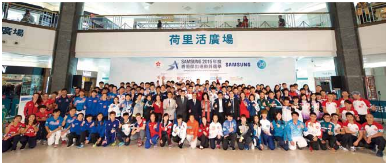
More than 100 athletes attended the Public Voting Announcement Press Conference at the Plaza Hollywood

The Announcement Press Conference was held at the Olympic House on 5 November 2015 to announce the details of the Rules and Regulations to the press and NSAs representatives. The Public Voting Announcement Press Conference was held at Plaza Hollywood on 9 January 2016 to disseminate the public voting mechanism to the public. Awards nominated athletes and teams attended the Press Conference to appeal to Hong Kong public to cast their votes for their sports stars. The public were invited to vote for their favourite athletes and teams on-site. A Media Luncheon for Sports Media was held at the Regal Hong Kong Hotel on 25 January 2016.