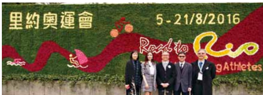
“Road to Rio – Support Hong Kong Athletes” logo was presented at the 2016 Flower Show