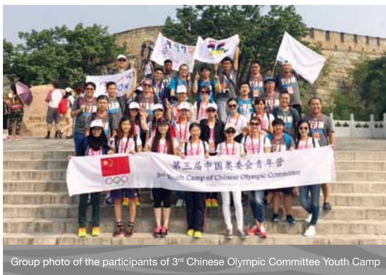
Group photo of the participants of 3 rd Chinese Olympic Committee Youth Camp