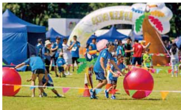
"Running with giant ball" in the 2016 Family Run