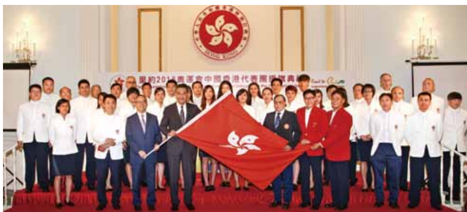
The Chief Executive presented the HKSAR flag to the Hong Kong, China Delegation at the Government House on 11 July 2016